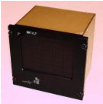
SOFIA Annunciator Panel

After substantial investigation and trade-off studies, both MAN Technologie and Kayser-Threde have selected CANaerospace as realtime communication bus for several highly mission critical SOFIA subsystems. Throughout the entire aircraft, even on the low-pressure cavity side, CANaerospace buses provide the connection between VME-based host computers and numerous realtime control systems performing functions such as star tracking control positioning, pressure window control and temperature/pressure monitoring around the telescope assembly structure. Also, operator station annunciation panels are integrated into